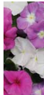
Summer Breeze Mixture